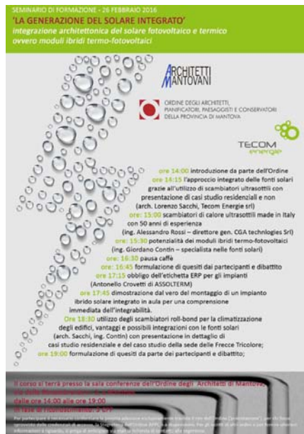
Presentation for architects on 26.02.2016

Further contacts are ongoing with AICARR, a national association of HVAC planners.