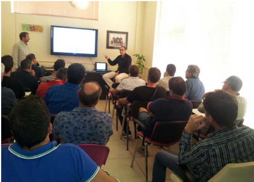
Training course with installers on 28.09.2016

Training activities are currently addressing installers , which are supposed to be the main stakeholder involved in package labelling. Each Assolterm member is organising approximately two trainings, with the aim of a total of at least 12 training courses on energy labelling and use of online tool.