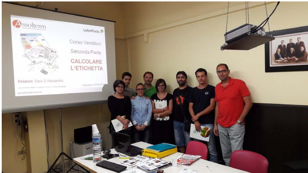
Training course with sellers on 20.09.2016

As anticipated, one of the scopes of the Italian NPP is to involve distributors and wholesalers through of the manufacturer, promoting the LabelPack A+ tool for energy labelling within training courses.