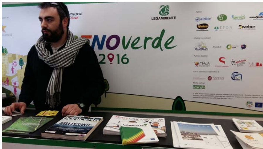
Picture of Green Train initiative by Legambiente

The brochure is currently being updated and will be further printed (5.000 copies). Moreover, Legambiente is produced 2 informative roll – up to be used during next dissemination activities scheduled. A video about energy labelling is being commissioned on the half of the consortium, and will be used for dissemination purpose