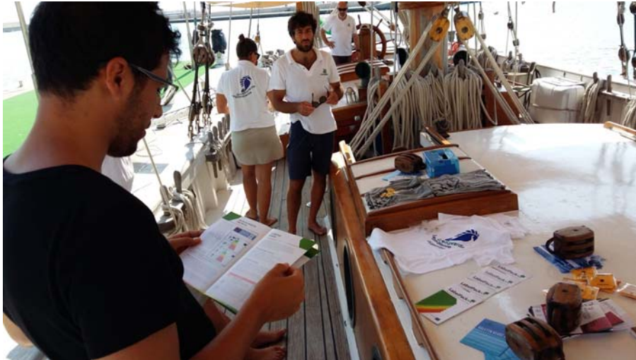
Picture of Goletta Verde initiative by Legambiente